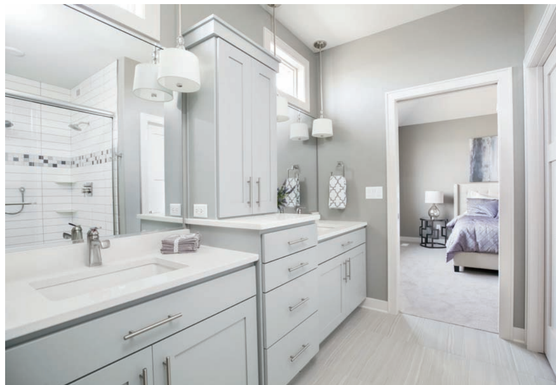
↓ Double vanities are connected by cabinetry which complements quartz countertops and overhead pendant lighting. Transom windows spill sunlight inside this well-designed space.