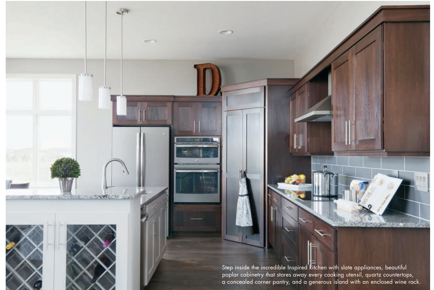
Step inside the incredible Inspired kitchen with slate appliances, beautiful poplar cabinetry that stores away every cooking utensil, quartz countertops, a concealed corner pantry, and a generous island with an enclosed wine rack.

The Inspired home collection by Dietrich Homes is the essence of exquisite design and excellent workmanship.