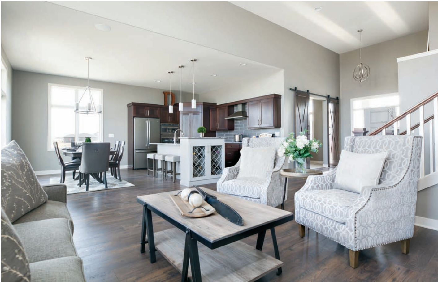
↑ Effortlessly open, the living room, dining area, kitchen and entryway showcases warm rustic wood flooring, attention to design details and a conveniently located stairway to upper and lower levels.

Not everyone wishing to build a new home desires massive square footage to go along with the equally large budget required to build one. However, homeowners requiring a more moderately sized home still demand the same quality construction and features. Inspired homes are designed for homeowners of all ages, combining excellent workmanship within moderate budgets and smaller footprint concepts. Good things definitely do come in smaller packages!