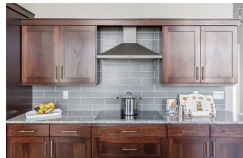
↑ Quartz countertops, grey subway tile, custom cabinetry with amazing storage detailing, and a modern range hood enhance this highly functional kitchen.