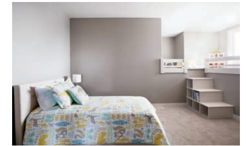
↑ A child’s bedroom fit for fairy princesses and dragon slayers offers a perfect loft play area or a great place for sleepovers.

Consistent quality, flow of design elements within each room and attention to every detail describe standard amenities throughout the entire Inspired collection of homes. Some of these amenities include custom cabinetry with quartz and granite countertops throughout, gorgeous ceramic and glass tile work in baths