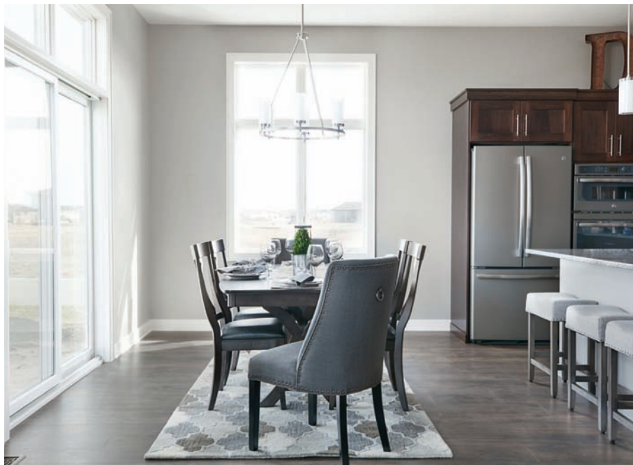
↑ Bathed in natural light, the dining space boasts wonderful outdoor views and is positioned near the kitchen with additional island seating.