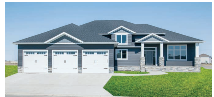
↑ Located at 1026 Hickory Lane in West Fargo, the Inspired model home's exterior features Carriage House garage doors, stone accents, seamless steel siding and a winding walkway leading to a welcoming porch.