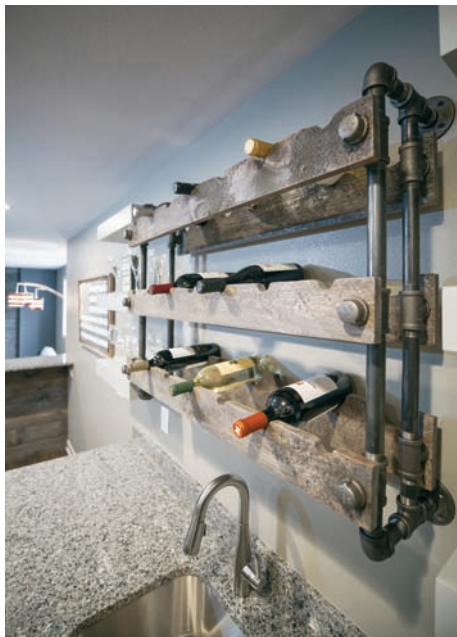
↑ Downstairs, a bar area features a unique, wall-mounted wine rack with urban flair.