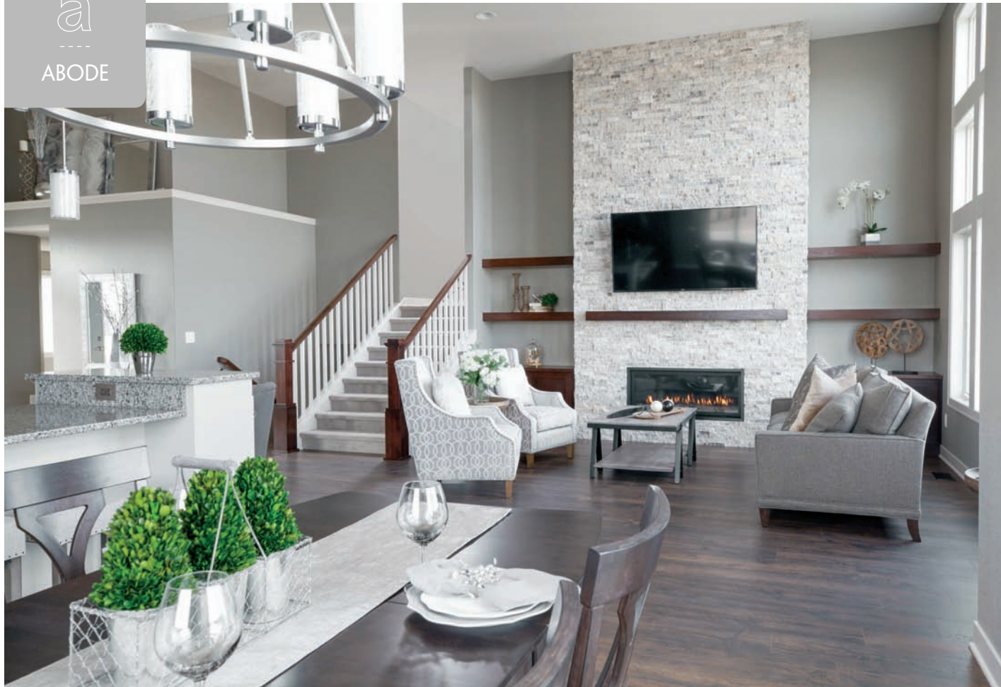
↑ The Inspired model home features 14-foot ceilings in the living room, 10-foot ceilings in the dining and kitchen and generous windows that welcome the outside in, providing an inviting and warm appearance.